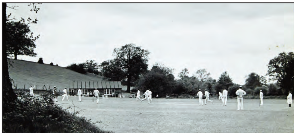
A match in play on the New Ground, circa 1964

As the contractor's work neared completion Member's working parties were needed to take down the Pavilion built in 1952 at Abinger Hall and move it to it's new site on the South-Western corner of the new ground. Working in dreadful winter conditions a water supply was installed together with a concrete base (the concrete moved by wheel-barrow across the Tillingbourne and along planks to the building site; the water supply was piped to the site from a point behind the bus shelter, (in later years it was extended to the cricket square). Once the Pavilion had been moved from the Hall and re-built, rudimentary toilets and an equipment shed were completed. This was a major effort by Members and much credit goes to H.O. Mockford for his skills and the drive he put into the work. Considerable administrative and legal work was needed and the Club were fortunate indeed to have David Ing, a Qualified Solicitor, as a leading Member who gave his services free of charge.