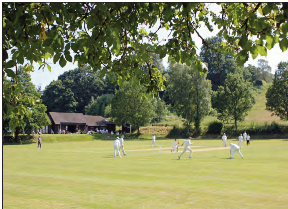
The Saturday XI vs Kingston Methodists July 2013