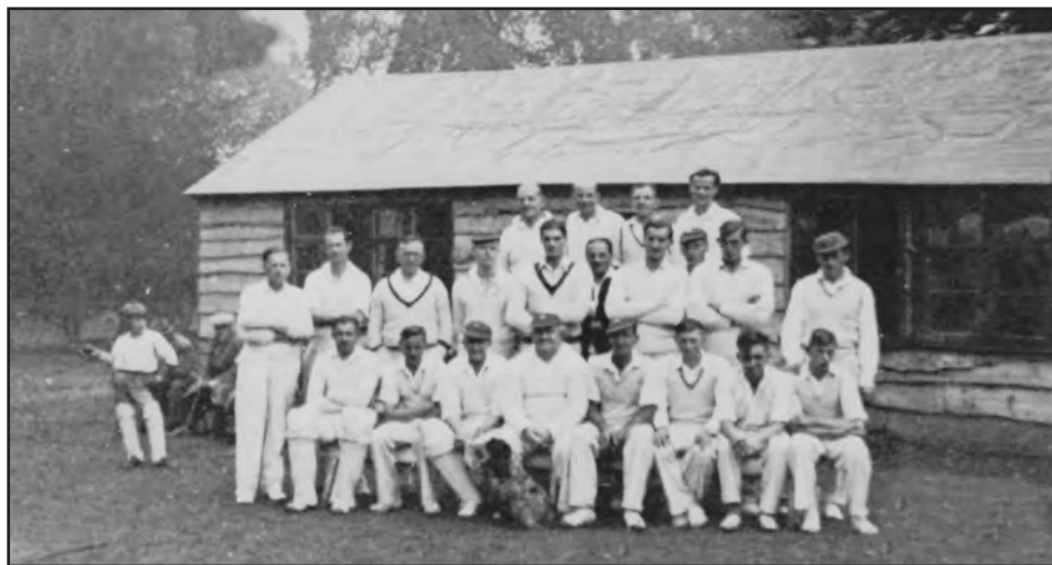
The New Pavilion in 1952. Abinger members prepare for a practice match.

fixtures; it seemed difficult to arrange many local games and lack of transport meant that travel to some away games was by hired coach. Saturday and Sunday Captains were elected each year and a team of ladies volunteered to provide teas.