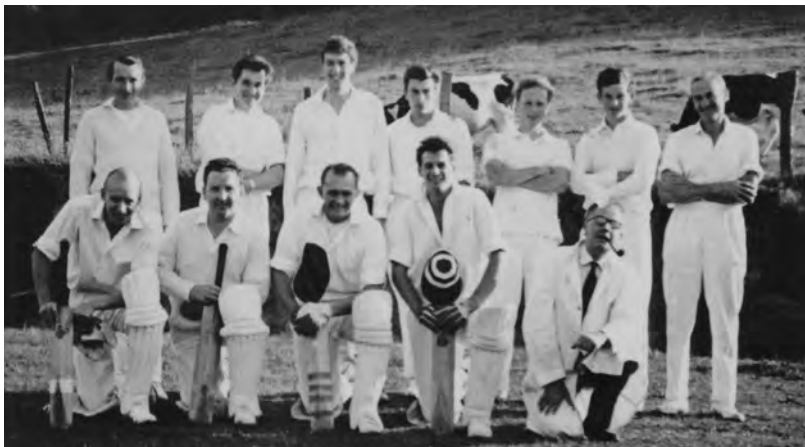
The Abinger Team 1964

By June, 1962, the outfield had been seeded and the turf on the square had started to grow. The pavilion was erected but much work was needed to complete the interior and landscape the surrounds. Finally the Club's ambitions were fulfilled and the Ground opened for its first full Season 1964.