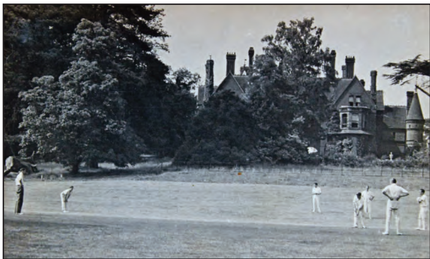
Cricket in play at Abinger Hall, 1949

It is not known if and when a Pavilion was built and the only surviving record of cricket prior to the 1930's is a series of photographs of a Women's Institute match between the Ladies of Abinger W.I. vs The National Federation of W.I.'s played in 1924. One doubts that the men of Abinger would have been involved.