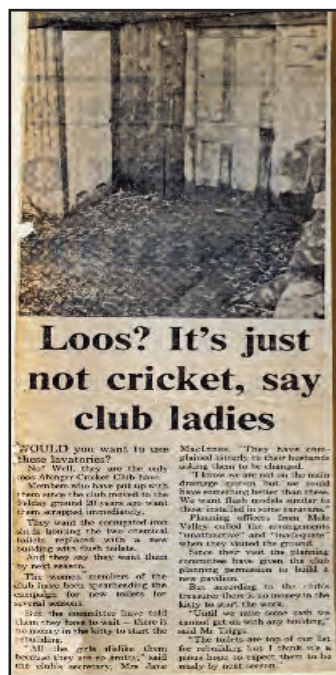
The Dorking Advertiser reports on Abinger's Toilets 1975

Complaints were made and possibilities for improvement were examined but the low-lying nature of the land and the proximity to the water table made proper sewage disposal and drainage almost impossible. It was at this point that ambitious ideas began to emerge for a new Pavilion on the Club's own land to the other side of the Ground.