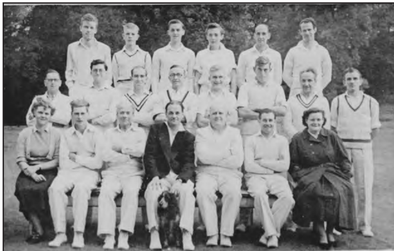
The Abinger Team circa 1953