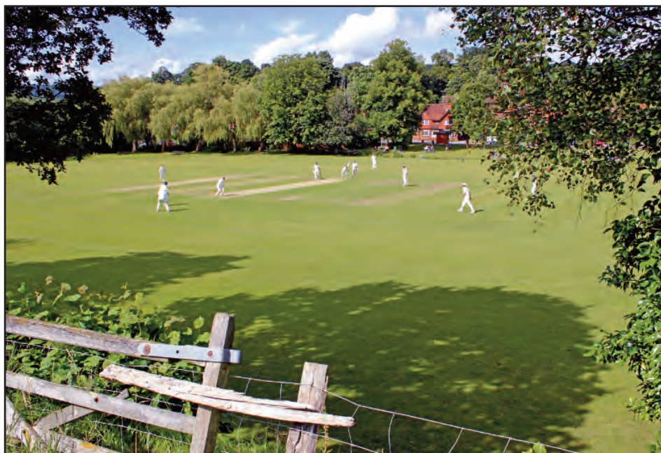
The Presidents Match in Play, 2011