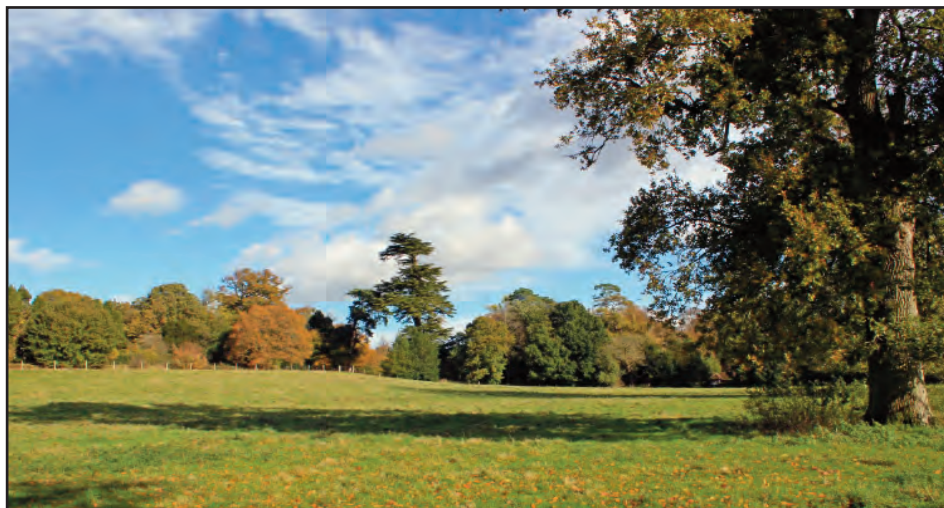
Abinger Hall Cricket Field today, 2013