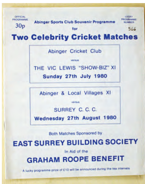
The Programme for two Celebrity Matches 1980