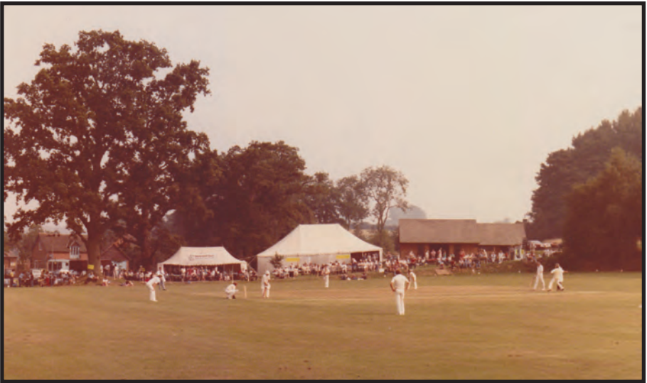
Abinger CC vs Surrey CCC August 1980