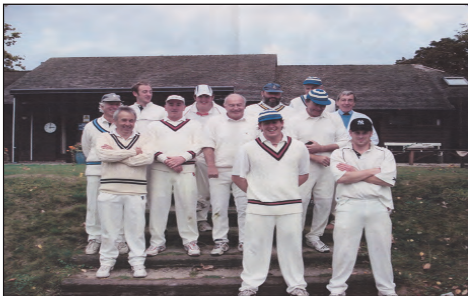
The Abinger 2nd XI in 2009

The Club is a village cricket club and was reasonably successful at that level, but there was a slight hiccup in 1988 when the 1st XI captain, who had been elected against the wishes of the Committee, attempted to persuade the Club that it ought to play at a higher standard and introduced some players who did not live in the locality and had no connection with Abinger. This was to the detriment of existing members, reducing their opportunities to play and causing some resentment. At an acrimonious AGM the Captain was voted out, but the Committee recognised that there was a demand for among some members for league cricket at a suitable level.