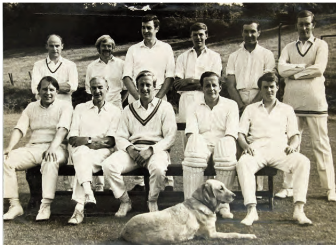
The Abinger Team 1970

By nature of it's location the Cricket Ground had become much more than a simple venue for Cricket. Abinger now had a handsome Village Green which, combined with the very well maintained River Tillingbourne, made an excellent leisure area for family picnics and children's play. The Parish Council installed a small play area with swings and slides and the Club built safe fencing against encroaching cricket balls.