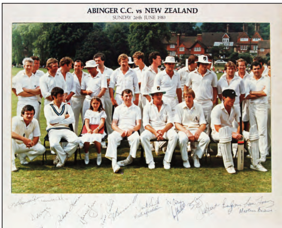
Abinger vs New Zealand, 1983

Some 3,000 spectators were ranged around the Ground. The Kiwis entered fully into the spirit of the day and contributed hugely to the entertainment, resulting in a substantial profit.